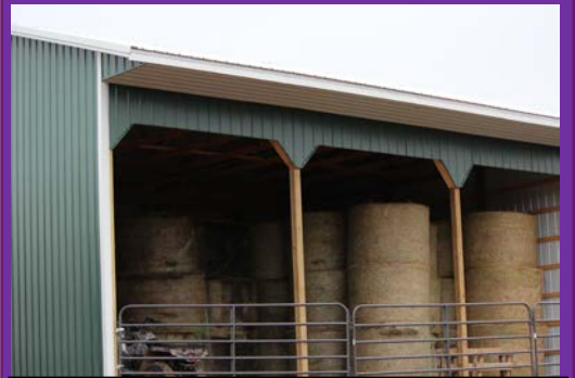
Our newly constructed hay barn.