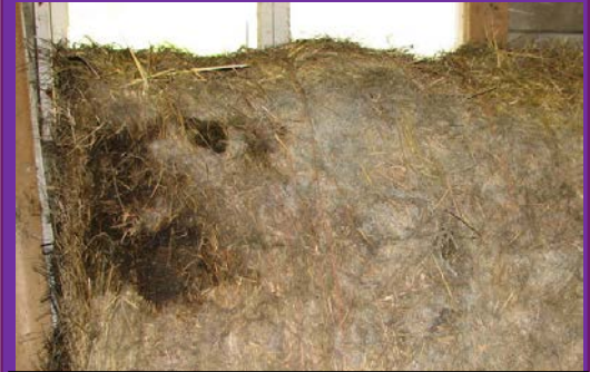
Moldy hay that was stored outside. (Photo not taken at Dreamchaser)

This past year at Dreamchaser we were able to construct a barn to store our hay out of the elements. This allows us to be able to store the hay we will be harvesting from our own pastures. There is also enough room to store our sawdust that is used as bedding in the stalls.