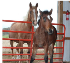
Brooks & Tucker